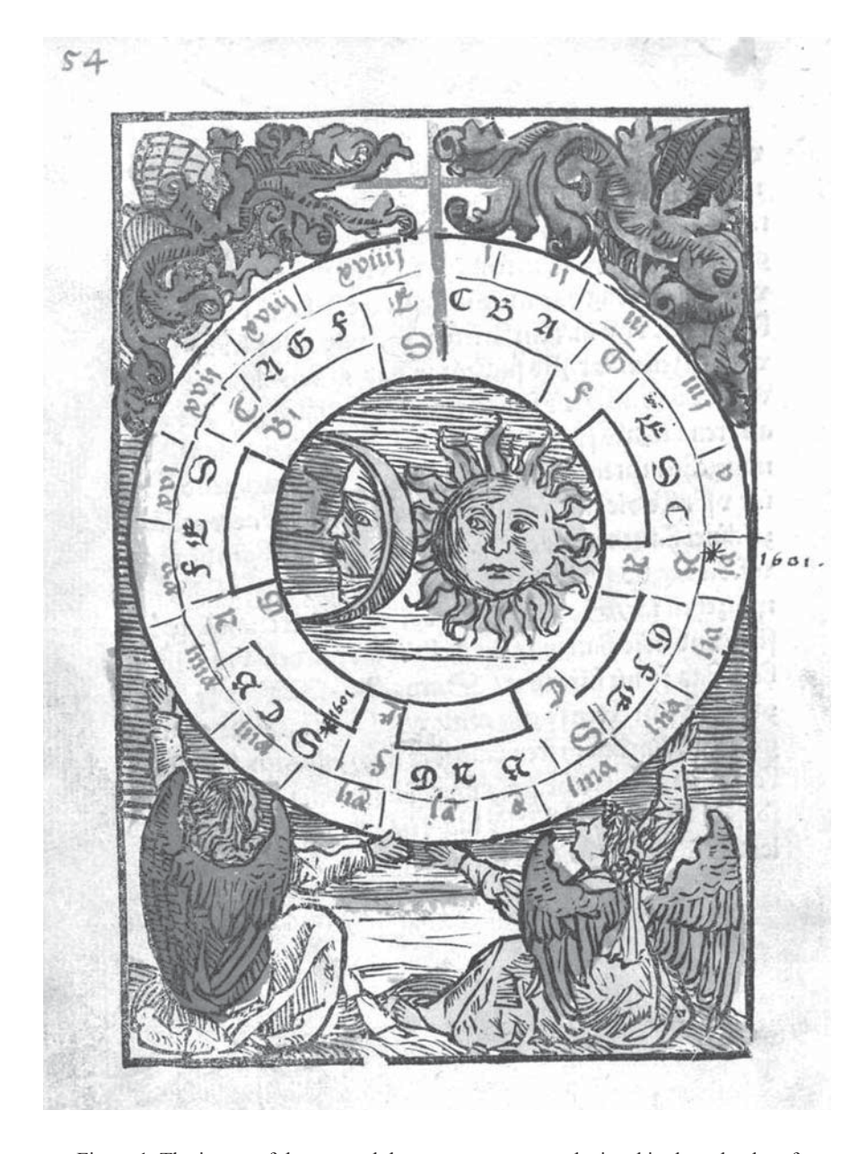
Figure 1. The image of the sun and the crescent moon as depicted in the calendar of Regiomontanus printed in Zurich in 1508. Source: Regiomontanus, Johannes, 1508. Ein Kalender mitt sinem Nüwen und Stunden us des hochgelerten Doctor Iohannis Kungspergers Practic unnd sunst vil subtiler Sachen mit vil Figuren als man am nechsten Blatt Lütrer Meldung findt, Zürich. S. 54. Available at: <a href="http://www.e-rara.ch/zuz/content/titleinfo/2780005">http://www.e-rara.ch/zuz/content/titleinfo/2780005</a>. [Accessed 23 July 2017].